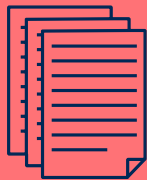
Online multiple-choice knowledge test